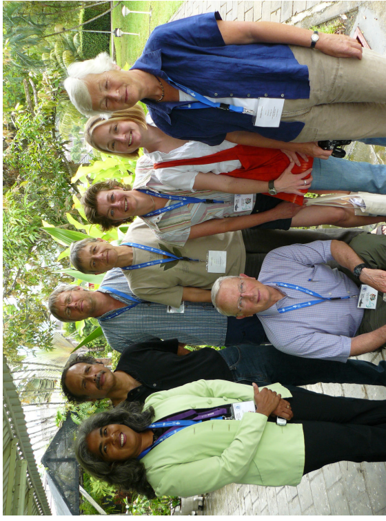
Participants of the 2008 Symposium